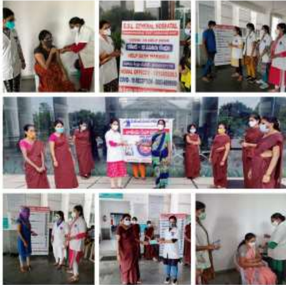
EACH ONE REACH ONE – COVID AWARENESS