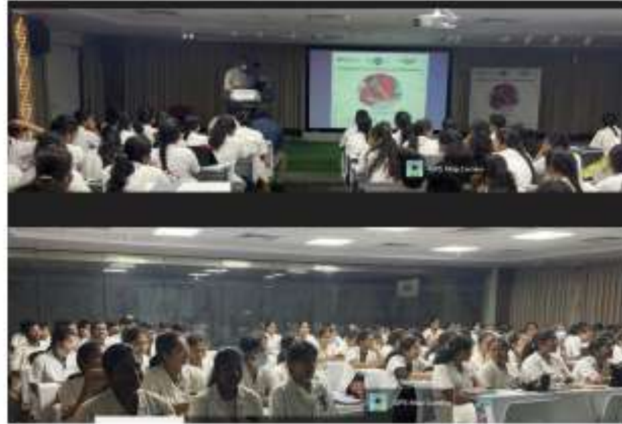
CLINICAL PHOTOGRAPHY PROGRAM