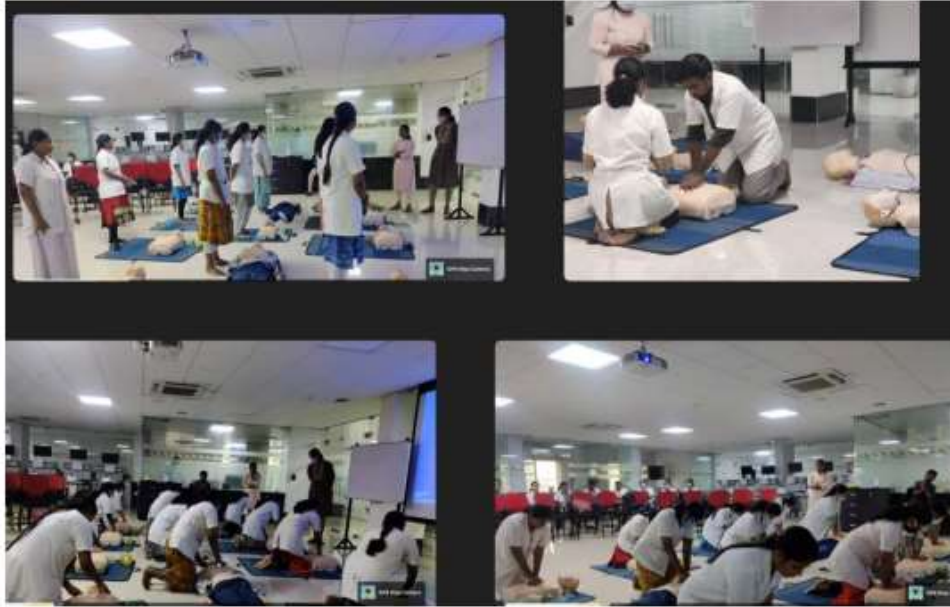
BASIC LIFE SUPPORT (BLS)