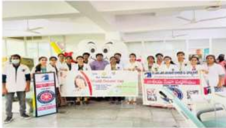
DOCTORS DAY CELEBRATIONS