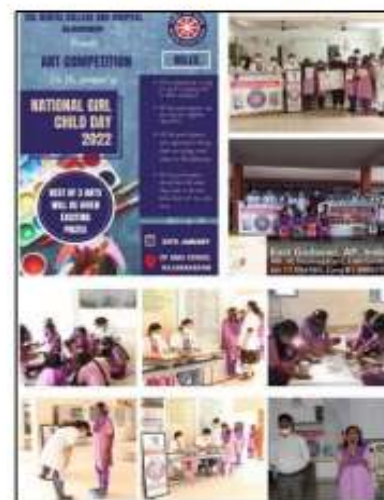
NATIONAL GIRL CHILD DAY