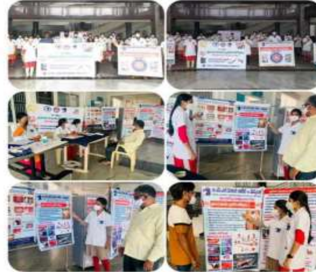
NO TOBACCO DAY