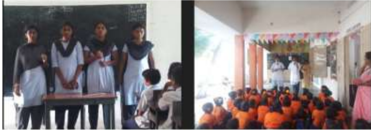
RIGHT TO HEALTH