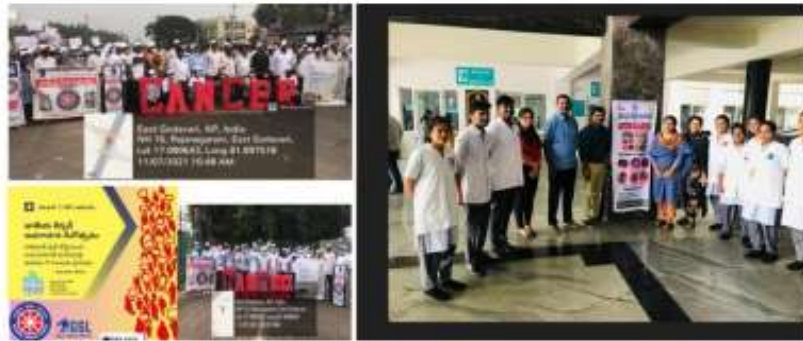
WORLD CANCER DAY