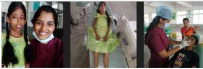
SPECIAL CHILDREN CAMP