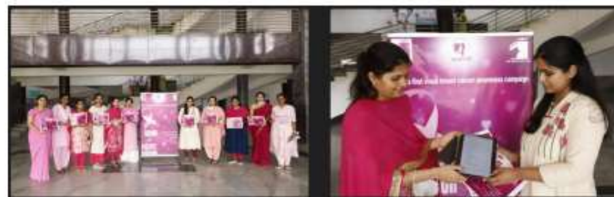
BREAST CANCER AWARENESS CAMPAIGN