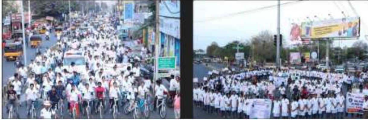
ROAD SAFETY AWARENESS CAMPAIGN