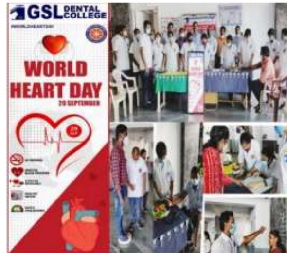
WORLD HEART DAY