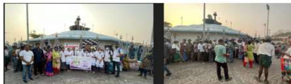
CLOTH DONATION DRIVE