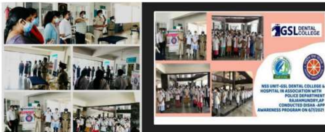
DISHA AWARENESS CAMPAIGN (WOMEN SAFETY)