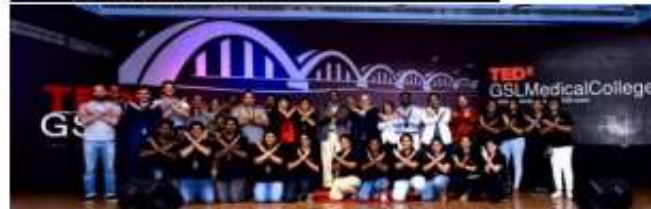
TEDx TALK SHOW