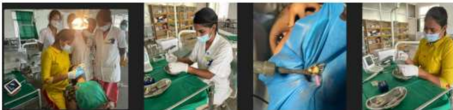
DEMO AND HANDS ON APEX LOCATORS