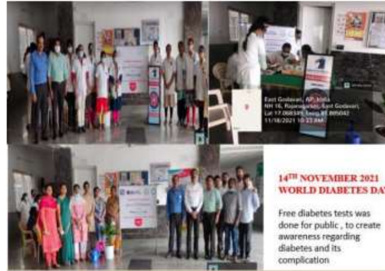
WORLD DIABETES DAY