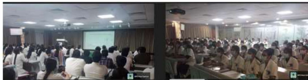
CBCT BASICS APPLICATION IN DENTISTRY