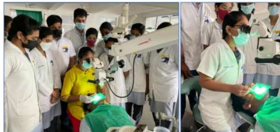
GOLD STANDARDS OF "MICRO ENDO PRACTICES"