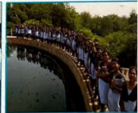
WATER PURIFICATION PLANT