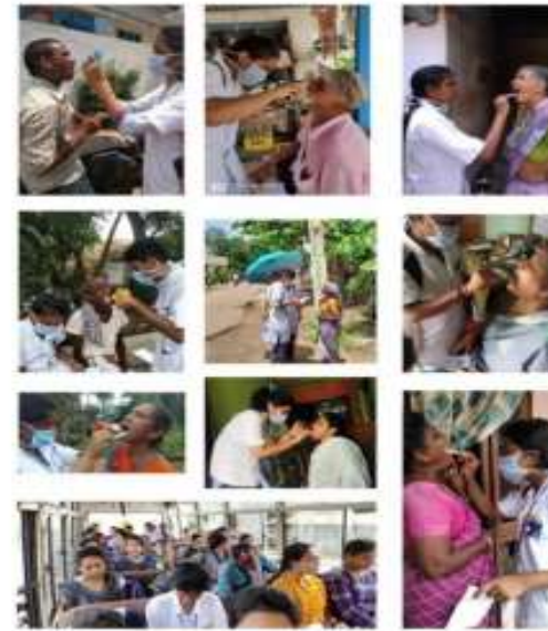
FREE ORAL HEALTH CHECKUP