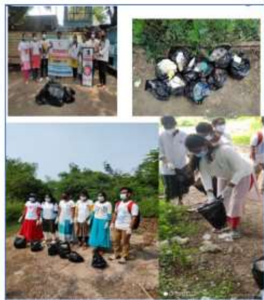
CLEAN INDIA PROGRAM